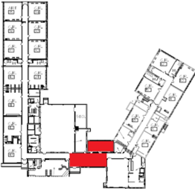
BUILDING RE-CONSTRUCTION AREA

lmariacher@iroquoiscsd.org astanfield@iroquoiscsd.org